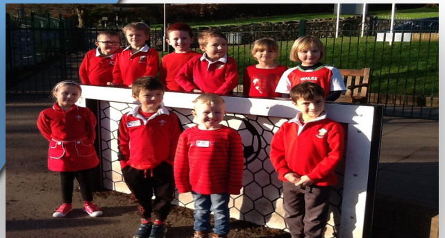
Right: Year 1 dress in Red to raise money for Velindre.

Left: Year 3 and 4 cheer wildly for their friends and teachers in the Teacher Vs Pupil Football match for Sport Relief.