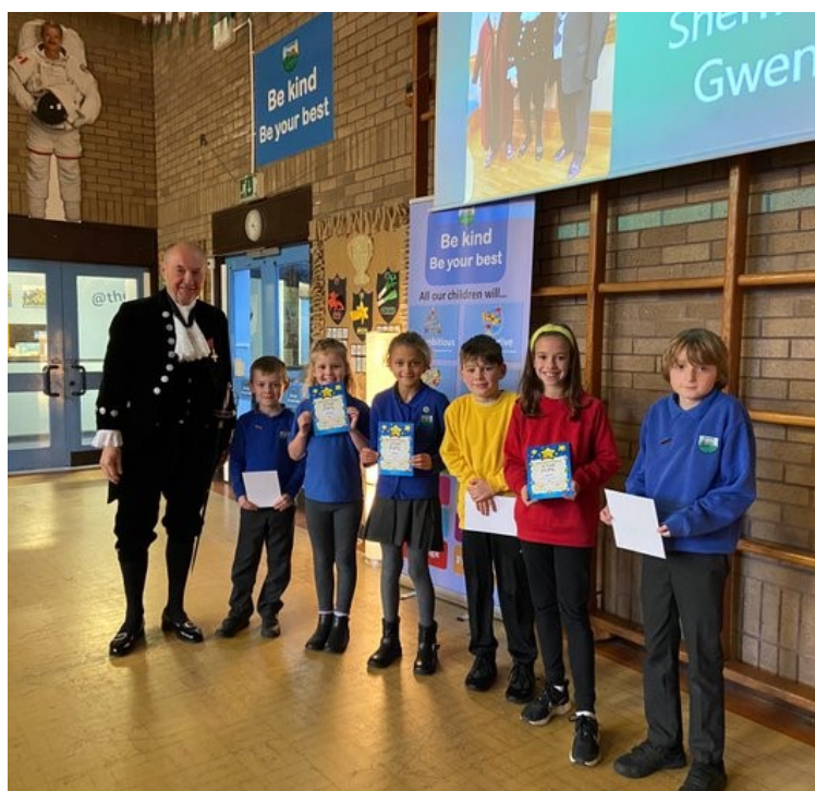
Huge thanks to the High Sheriff of Gwent who visited school in November to present Star Pupil certificates to our learners. He also led a fantastic assembly on his role and charity work. Diolch!