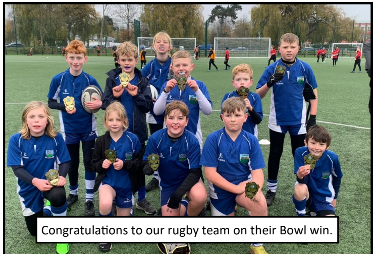
Congratulations to our rugby team on their Bowl win.