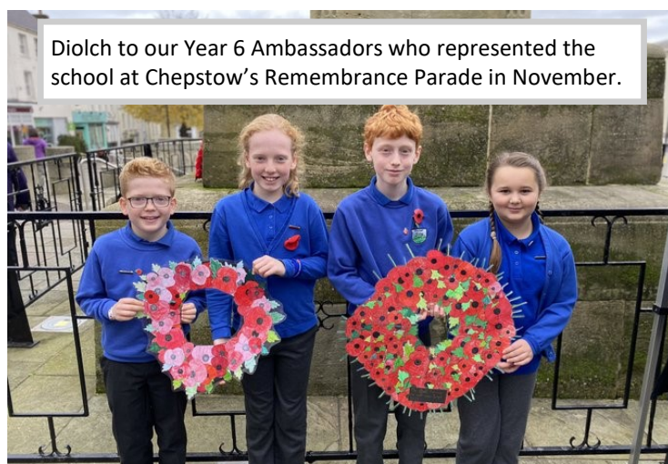
Diolch to our Year 6 Ambassadors who represented the school at Chepstow's Remembrance Parade in November.