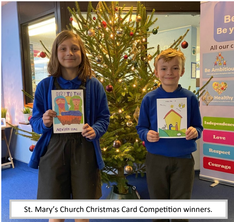
St. Mary's Church Christmas Card Competition winners.