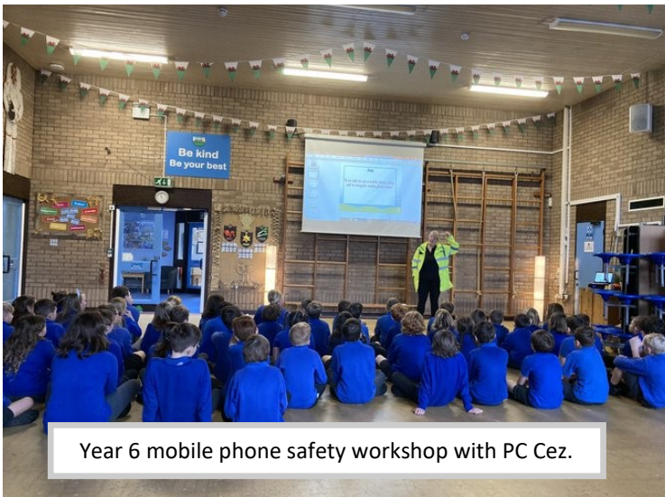
Year 6 mobile phone safety workshop with PC Cez.