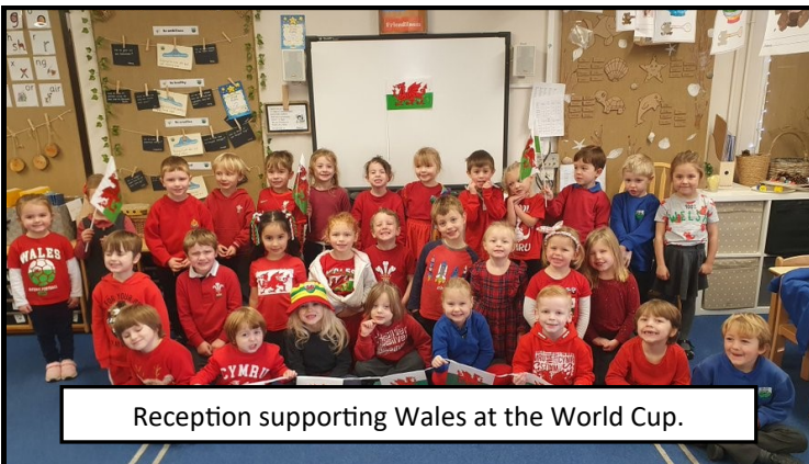
Reception supporting Wales at the World Cup.