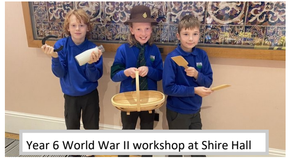
Year 6 World War II workshop at Shire Hall

"I've enjoyed working on our MY TIME projects this term. My project is about being ethical and investigating games played long ago."