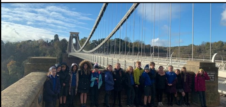
Year 5 visited Clifton Suspension Bridge for their Inventions theme.