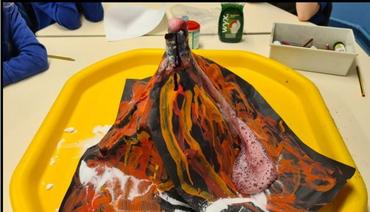
Year 1 making volcanoes erupt as part of the Discoveries theme.