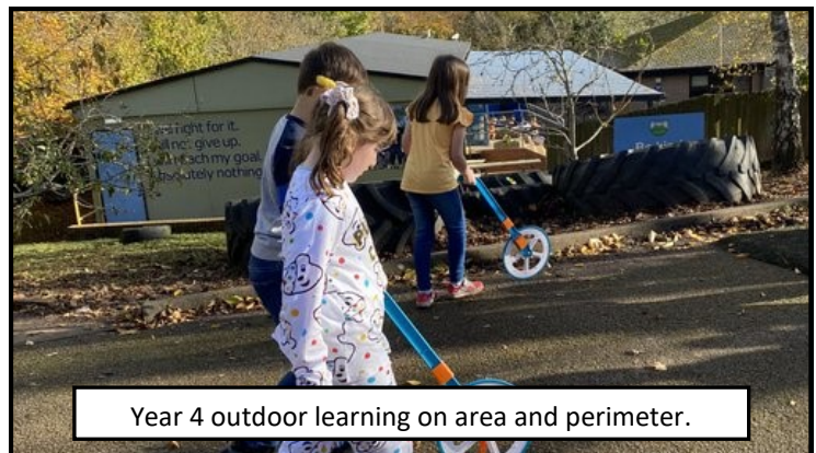
Year 4 outdoor learning on area and perimeter.