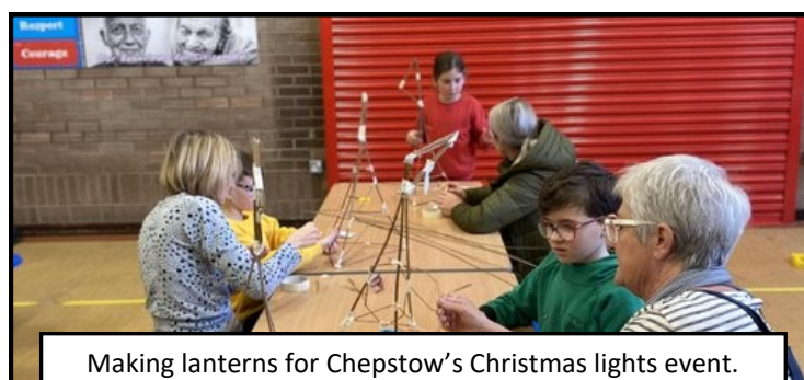
Making lanterns for Chepstow's Christmas lights event.