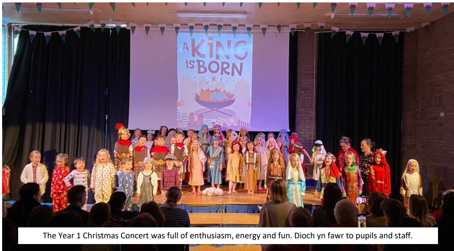
The Year 1 Christmas Concert was full of enthusiasm, energy and fun. Diolch yn fawr to pupils and staff.